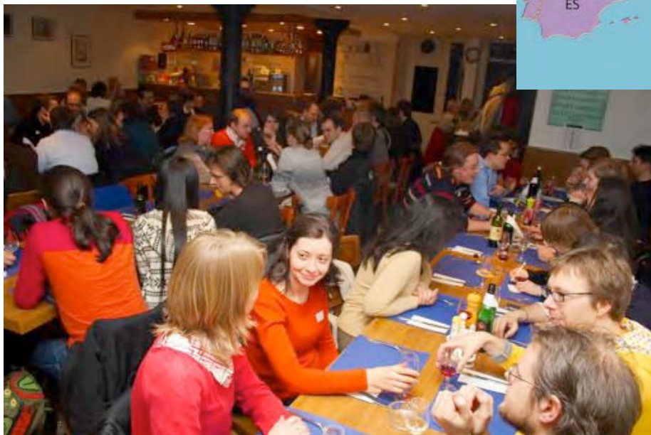
Left: Delegates enjoying their well-deserved dinner after a long day during the conference in Fribourg.