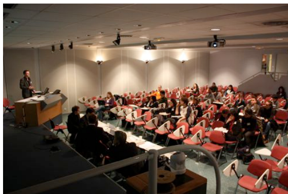
François Briatte in front of the Eurodoc audience.

of a doctorate in France indeed reveals a rather bleak picture of low job prospects in academia,