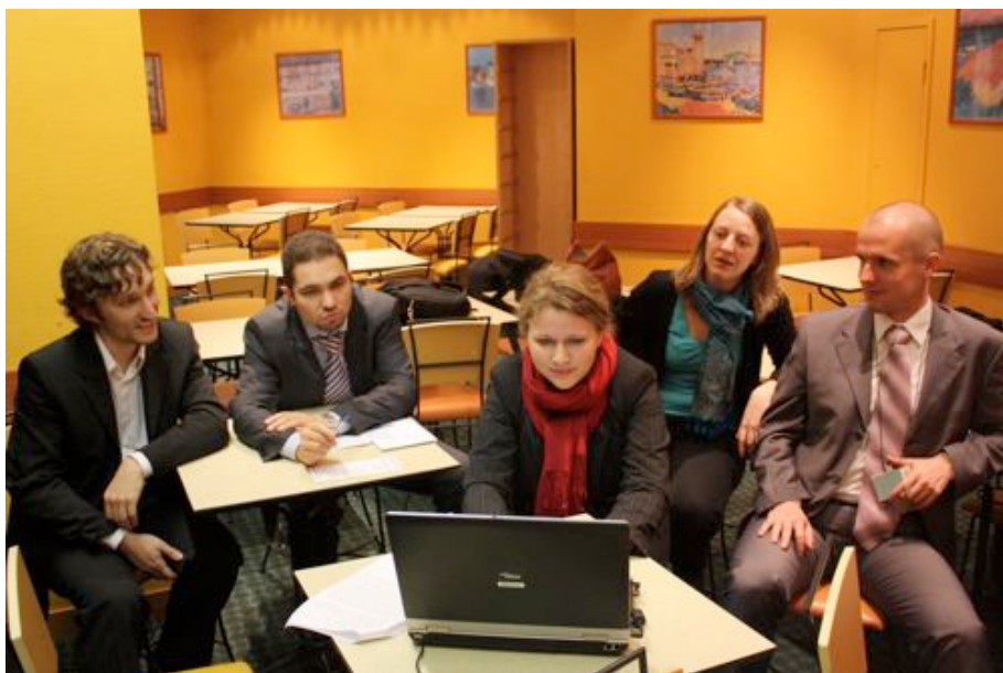
Eurodoccers working the whole night through until 2:22!

Formerly known as the C&C labelling mechanism, the HRS aims at bringing effectiveness to the implementation of the C&C through an established, recognized and transparent process that is supported by appropriate templates and monitoring tools. HEIs remain free to choose whether to adopt the HRS or not, and