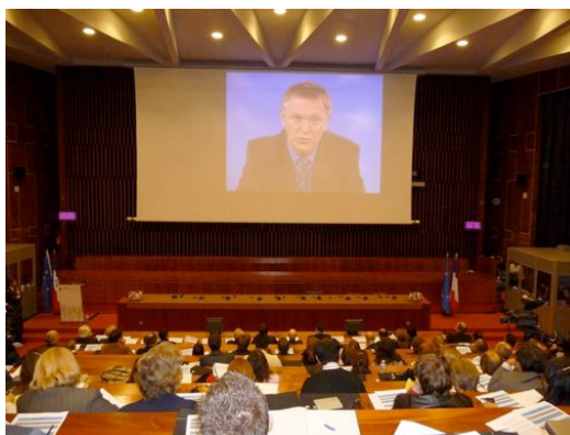
Rennes conference video message by Commissioner Janez Potočnik already failed by quite a margin to meet the target set for 2010 without exception.

Since the launch of the European Charter for Researchers and Code of Conduct for the Recruitment of Researchers (C&C) in March 2005, little has been done in terms of actual implementation by European higher education institutions (HEIs) and/or governments. The non binding nature of the recommendation coupled to a relative failure in communicating the benefits of the recommendation within the European higher education and research community might provide some degree of justification to some, while others may consider that more fundamental reasons are reflected in the general lack of results that has so far characterised the Lisbon agenda. To illustrate this point, it is worth remembering that all member states that did not satisfy the 3% GDP target in 2001 have